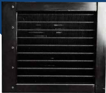
High air-capacity of 1.600 m 3 /hr