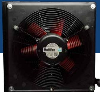
Robust A-class quality fan