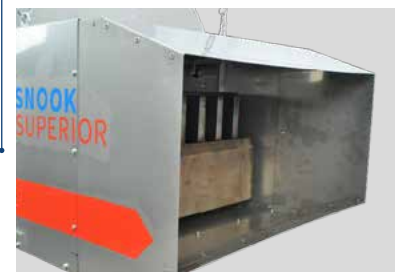
Heat exchanging unit