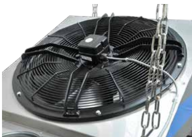
Robust A-class German quality fan