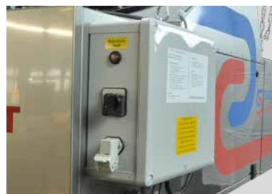
Electronic parts in plastic housing